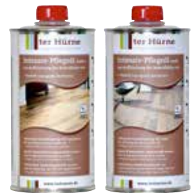
Intensive Conditioning Oil transparent/white

Note: If traffic is exceptionally high, the surface should be renewed by a qualified parquet flooring expert if at all possible.